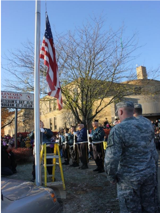
Veterans Day Celebration